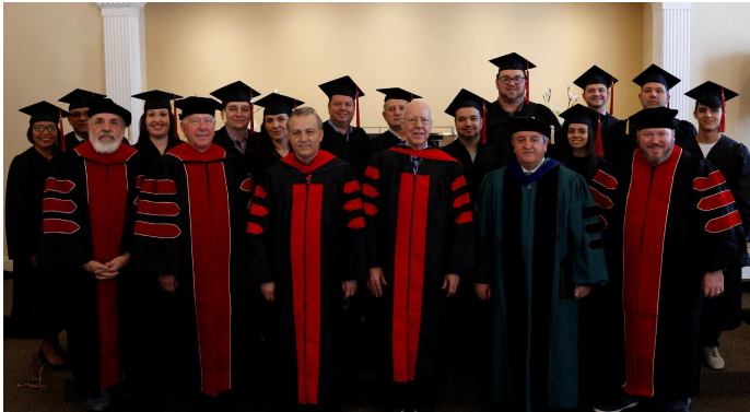
MTC Graduation Class, January 2020