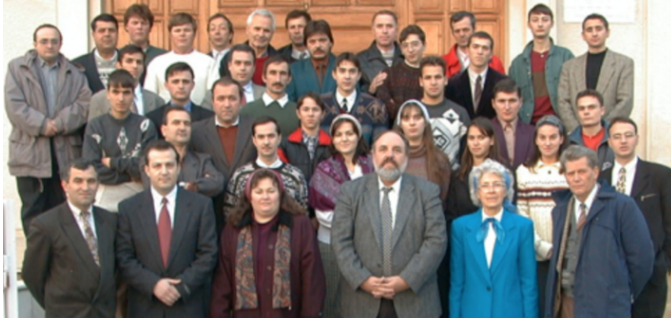
Graduating class of 1999 in Arad, Romania